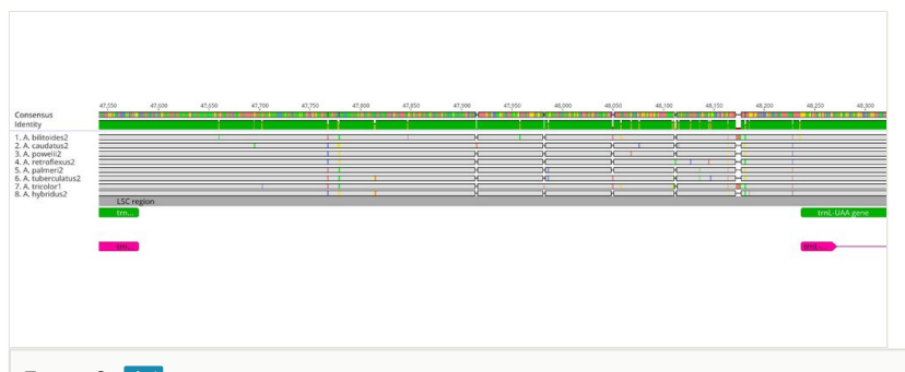
Figure 2. doi

Variability between the Small Single-Copy (SSC) region and the Inverted Repeat (IR) regions. Alignment of eight amaranth chloroplast genomes using MAFFT depicts high levels of polymorphism in the SSC. Each vertical line or gap depicted in each sequence corresponds to a polymorphism between tested species. Genes are depicted in green and tRNAs are shown in pink.